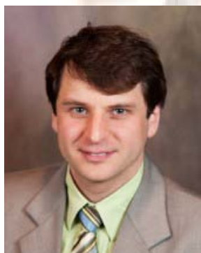
GM Yury Shulman

FEATURING FOUR WORLD CLASS CHESS GRANDMASTERS